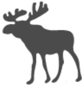
Abercrombie & Fitch